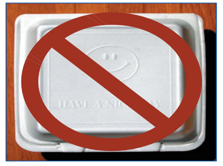
For information contact one of our local representatives at 876-3340

Cotton Fabric 1-5 months Apple core 2 months Paper 2-5 months Canvas products 1 year Milk Cartons 5 years Filter-Tip Cigarettes 10-12 years Painted Board 13 years Plastic Bags 10-20 years 25 - 40 years Leather Shoes Disposable Diapers 75 years Tin Cans 100 years Aluminum Cans 100-500 years Plastic bottle 450 years Glass NEVER Styrofoam NEVER